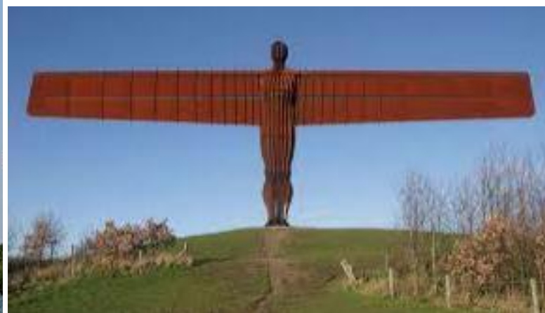
Antony Gormley Sculptures