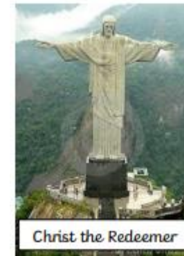
Christ the Redeemer