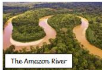
The Amazon River