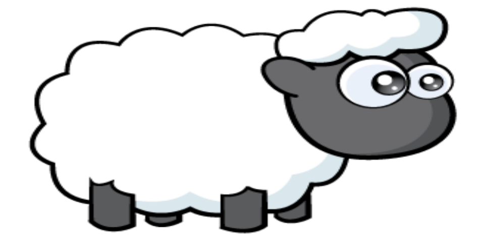
37 cm long