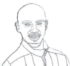
Sir Mo Farah

Is the Head of the Armed Forces and Head of the Church of England.